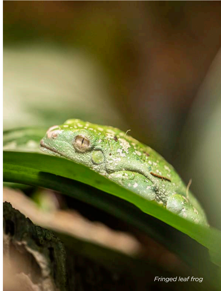
Fringed leaf frog