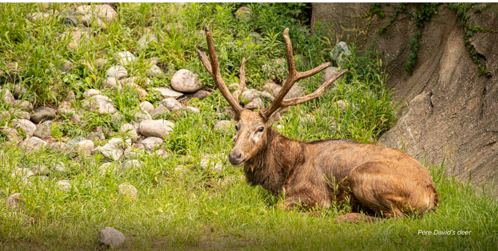
Père David's deer