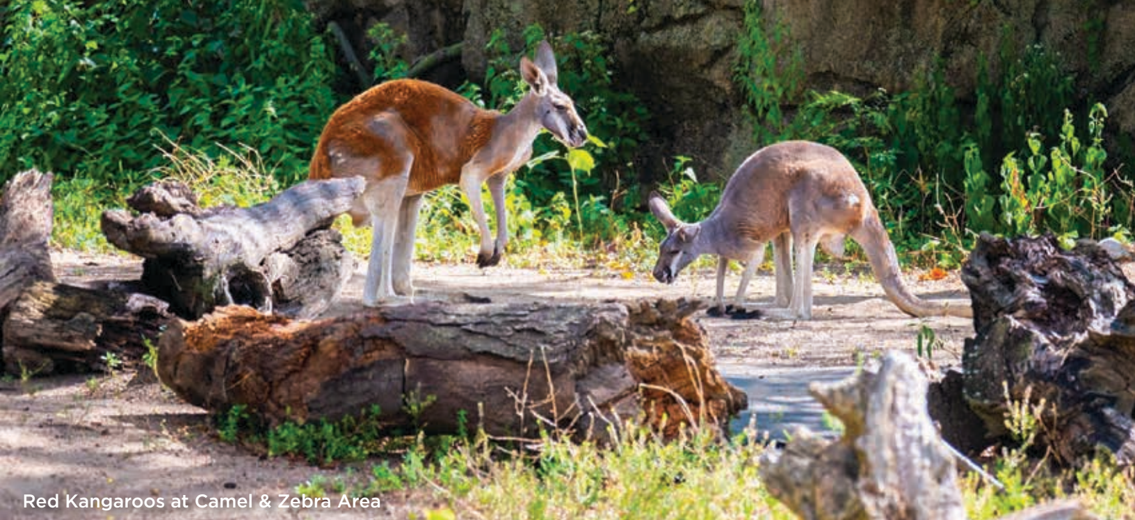
Red Kangaroos at Camel & Zebra Area