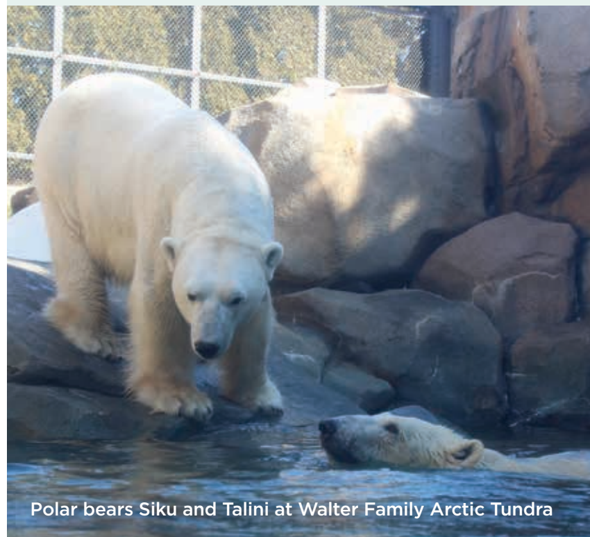
Polar bears Siku and Talini at Walter Family Arctic Tundra