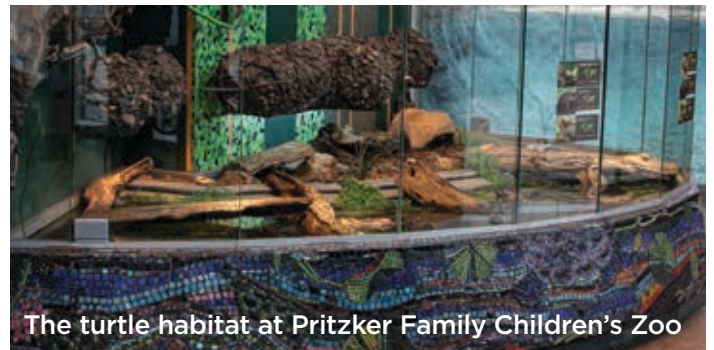
The turtle habitat at Pritzker Family Children’s Zoo