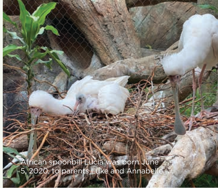
African spoonbill Lucia was born June 5, 2020, to parents Luke and Annabelle.