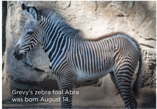
Grevy's zebra foal Abra was born August 14.

Due to the efforts of our horticulture team, Lincoln Park Zoo's herbaceous perennial collection was granted national accreditation status by the Plant Collections Network last fall. The small but mighty group of horticulturalists is now working hard to prepare the zoo's gardens and grounds for spring. Lincoln Park Zoo scientists have been busy in the field and at home working