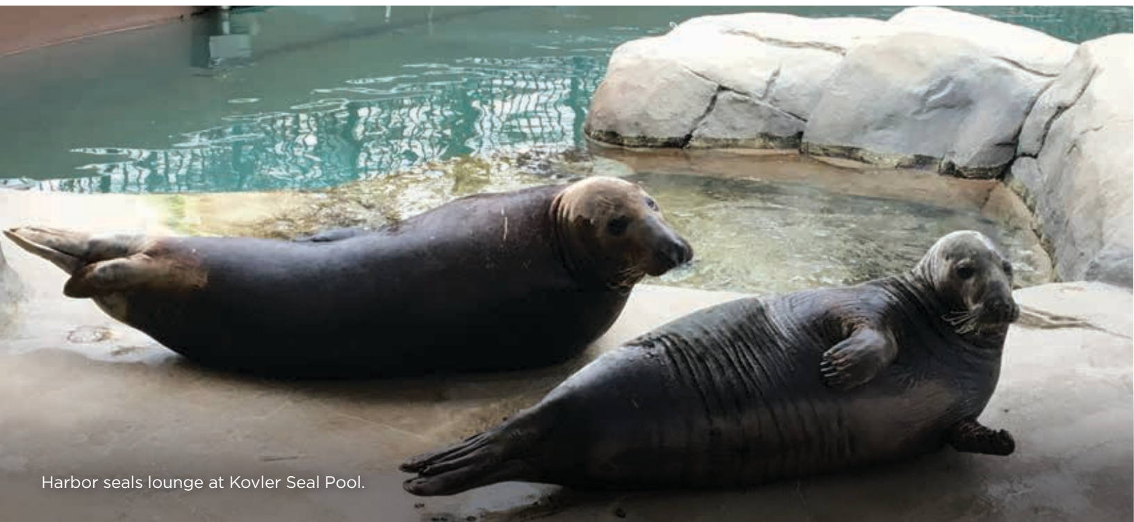
Harbor seals lounge at Kovler Seal Pool.